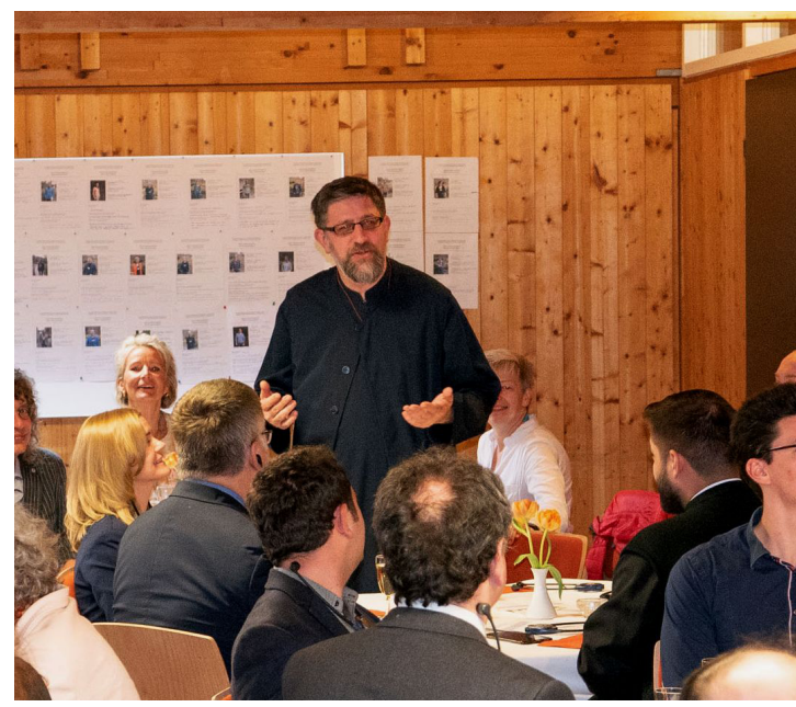
Participants of the study course 2017

To ensure the success of the study course, participants are expected to be present for the entire duration of the course.